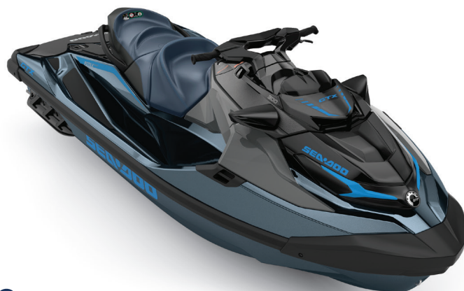
NEW Abyss Blue and Gulfstream Blue