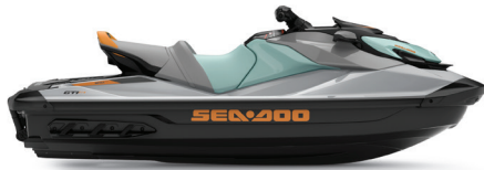
GTI™ SE 170