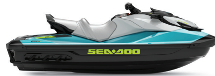
GTI™ SE 170